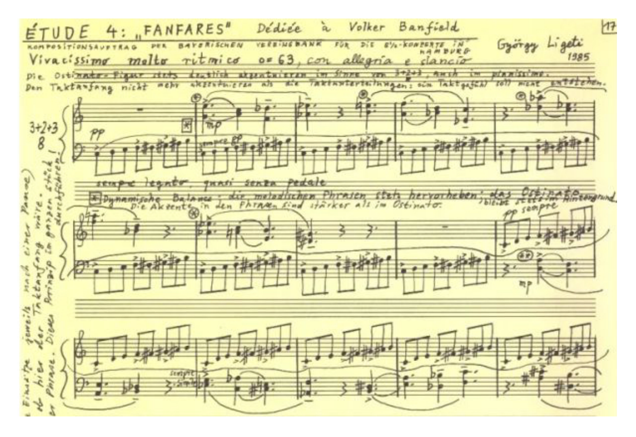
Beginning of "Fanfares" from Schott's facsimile edition, Etudes for Piano