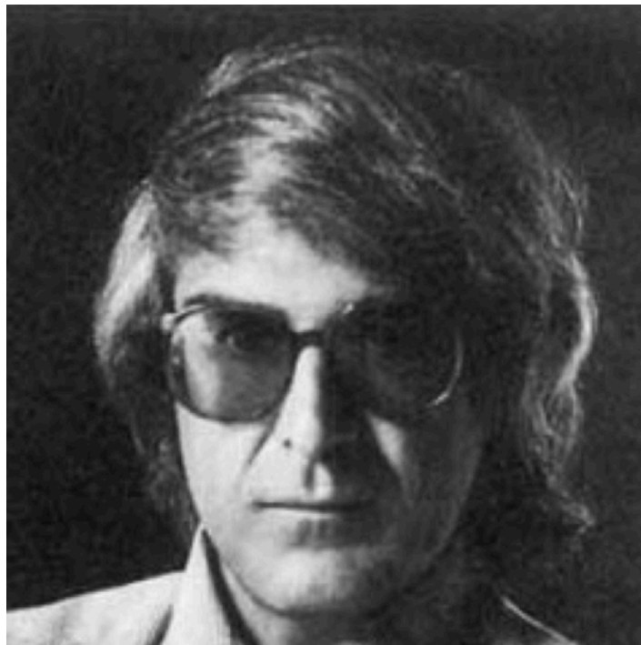
Novelist, Poet, Essayist ALEXANDER THEROUX (b. 1939)